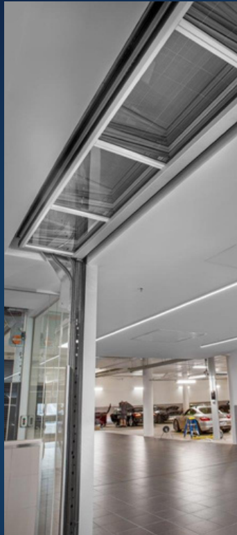
Project: Car Dealer Melbourne, Australia