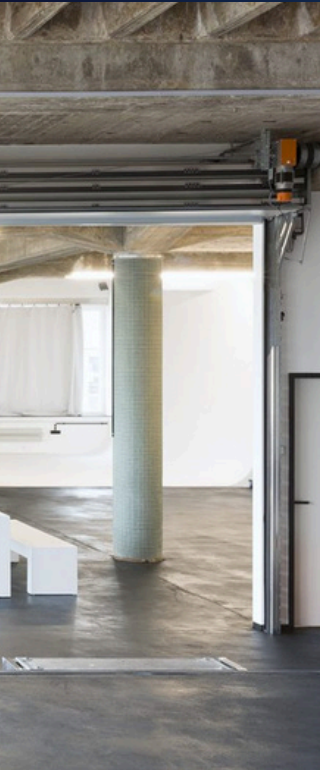
Project: RAW Studios, Berlin, Germany