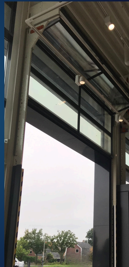
Project: Mercedes Baan Netherlands