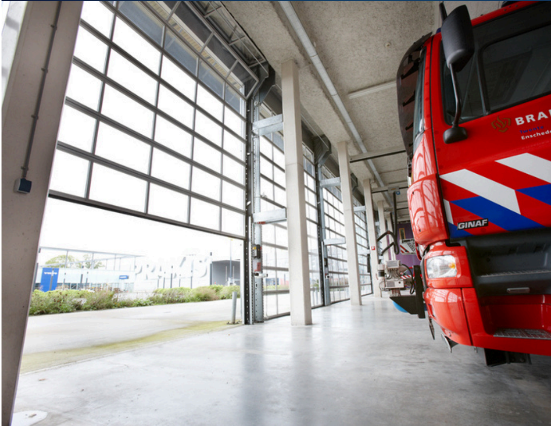
Project: Fire station Hoevelaken Netherlands