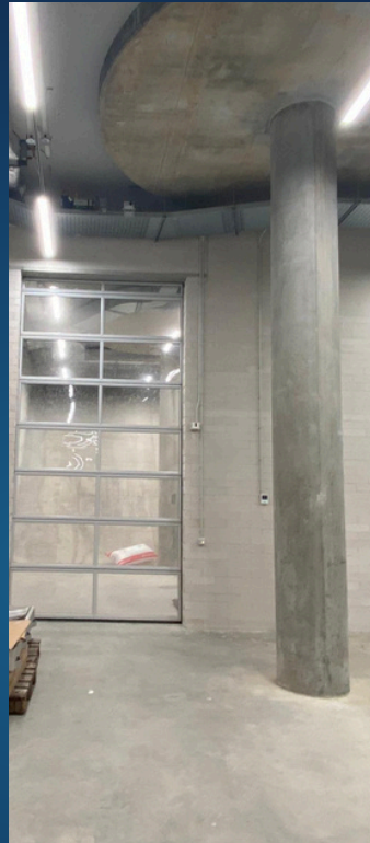
Project: Museum Depot Boijmans, Rotterdam, Netherlands