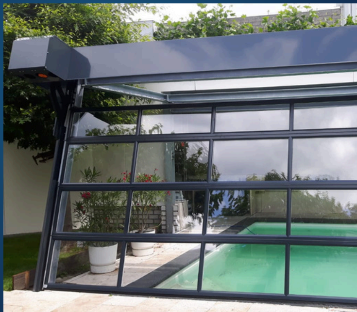
Project: Private swimming pool, Netherlands

If you need all the space inside, you can mount the door on the outside. All moving parts are then outside the room or even outside the building. This option is often used for spray booths and car washes.