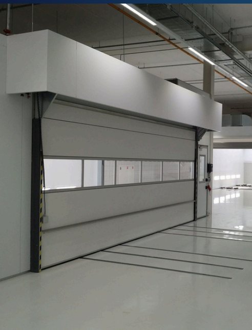
Project: Van Mossel KfZ, Netherlands